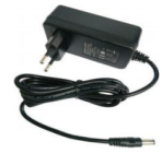
DC12V/3A Power Supply