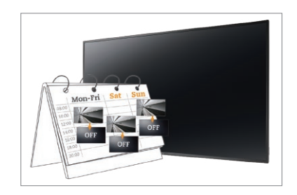
Built-in scheduler automatically activates and deactivates the PM-55 with designated input signal according to programmed schedules