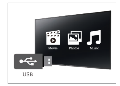
USB Playback for easy multimedia content presenting