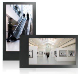
Flexible orientation: portrait/ landscape