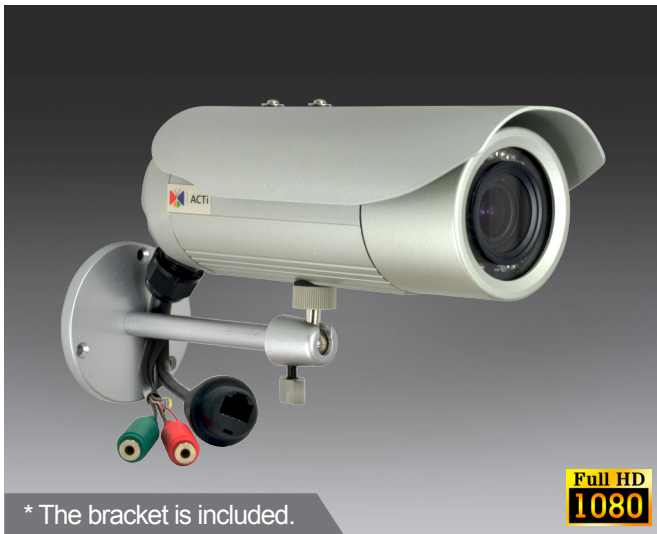
* The bracket is included.

3MP Bullet with D/N, Adaptive IR, Vari-focal Lens