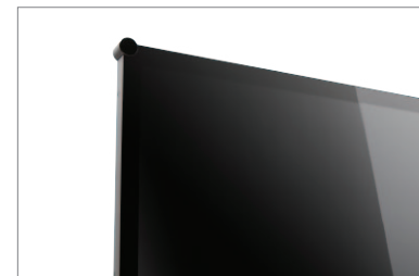
A rating of IP54 attests to its extraordinary protection against dust and water spray