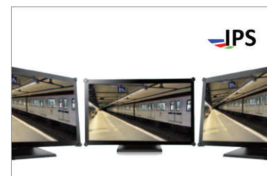
IPS panel provides superb clarity from all angles