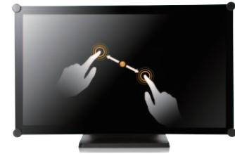
Integration of dual-touch and projected capacitive touch technology provides accurate and precise touch experience