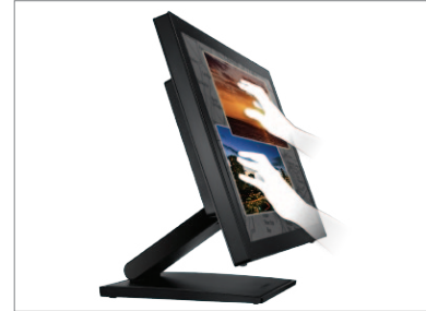
Integration of 10-point touch and projected capacitive touch technology provides accurate and precise touch experience