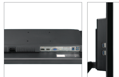
Versatile connectivity: VGA, HDMI, DisplayPort and USB port allow for effortless system integration